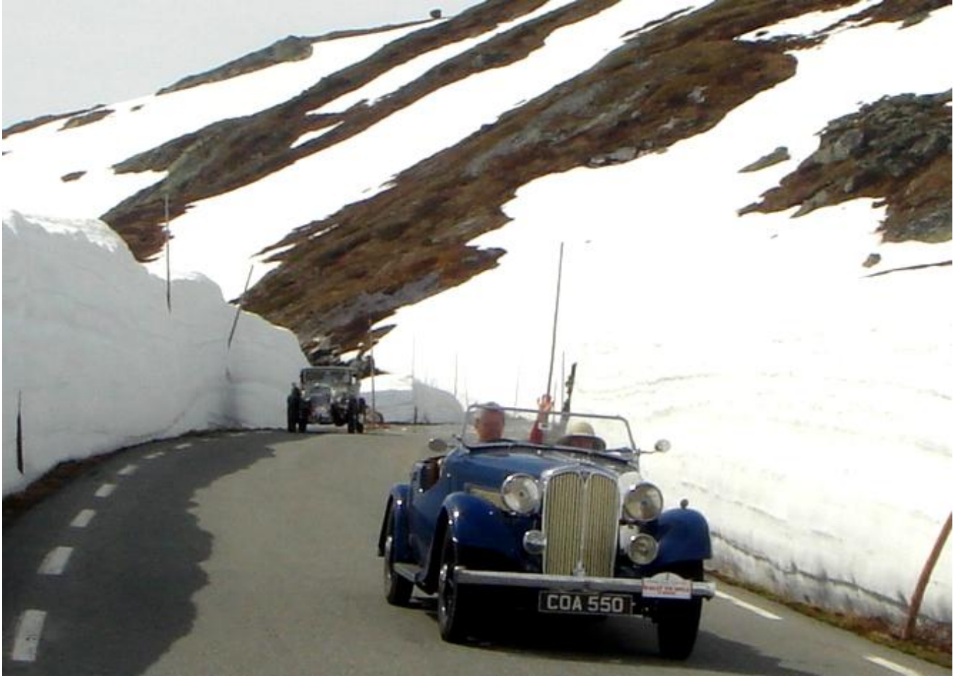
Sogndal Pass, Norway

The ever popular Viking Tour, first run twenty years ago, ties in once again with British Car Week in Gothenburg and the amazing Tjoloholm Castle Rally where one thousand classic and vintage cars from all over Scandinavia gather each year in the grounds of this 18 th century mansion built by a Scottish brewing magnate.