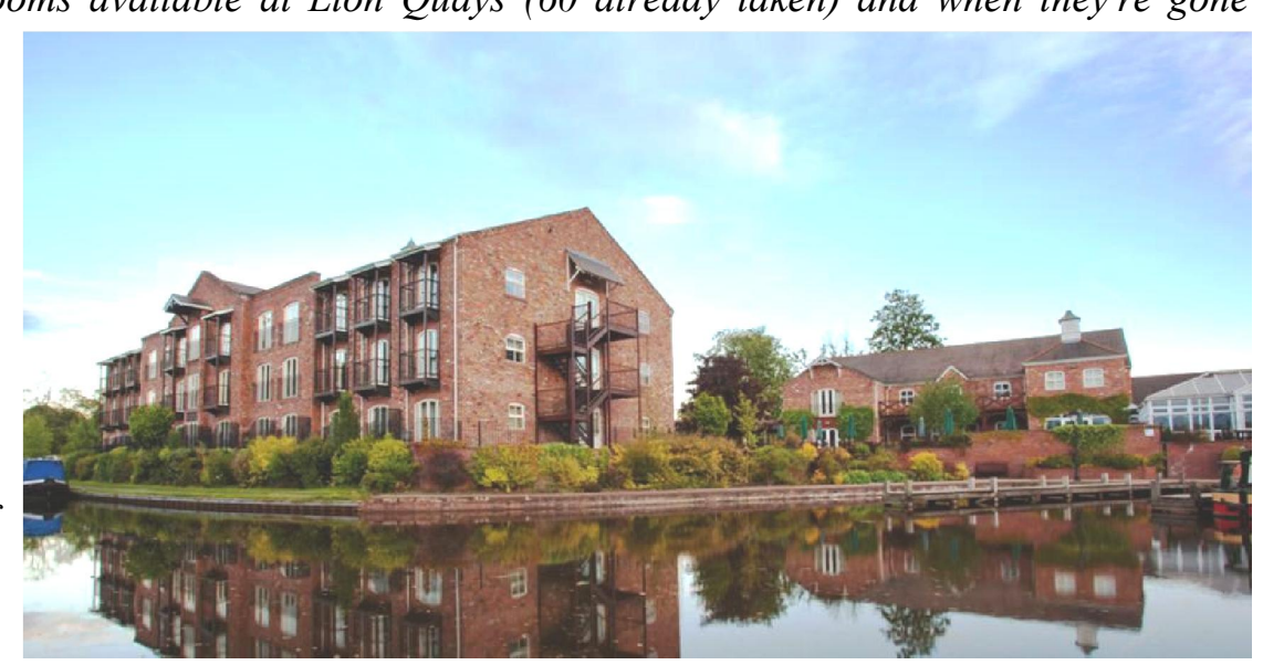
Lion Quays Hotel & Spa

that's it as there are no other hotels near by. Enquiries exceeded capacity at the Grange in 2019 and some people were disappointed so to be certain of a place book early!