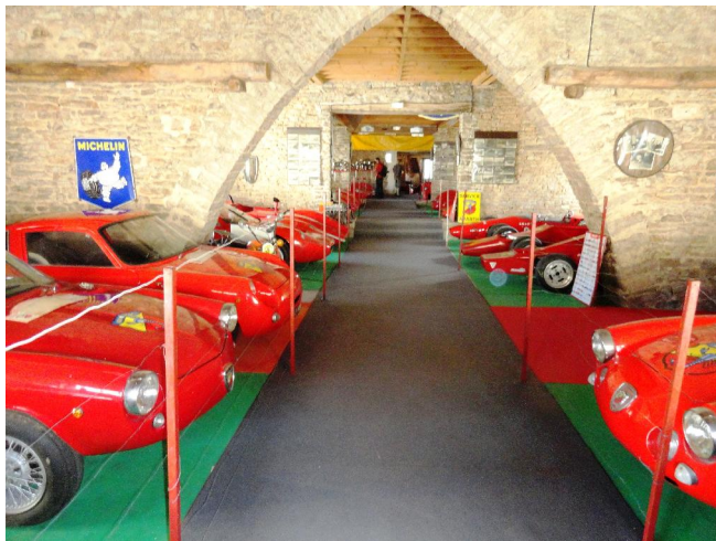
Top: Vaux le Vicomte. Above left: Our hotel in Gosnay. Above right: Our Rouen centre hotel. Left: Chateau Savigny-les-Beaune